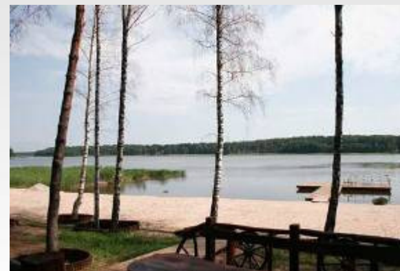
The lake DUNEZERS